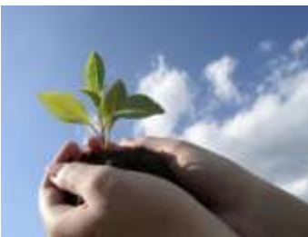
Camp Kata Kani is growing fun in the dirt this year, and sharing it with others too!

BUT REMEMBER TO COME DRESSED FOR A MESS!